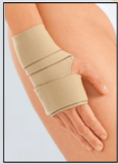
circaid® juxtafit® essentials hand wrap

MRP. Rs 16985/- (CG-ARM-LEFT/RIGHT) Rs 7582/- (Hand Wrap)