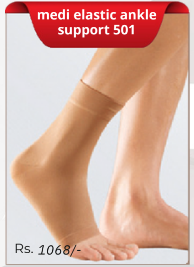
Two-way stretch ankle support in a medium compression with fitted heel