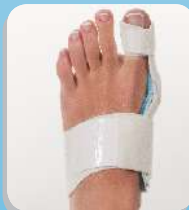
The solution Bunion Aid Splint