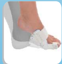
... while maintaining mobility!