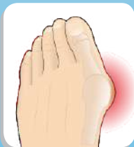
The problem Painful bunion